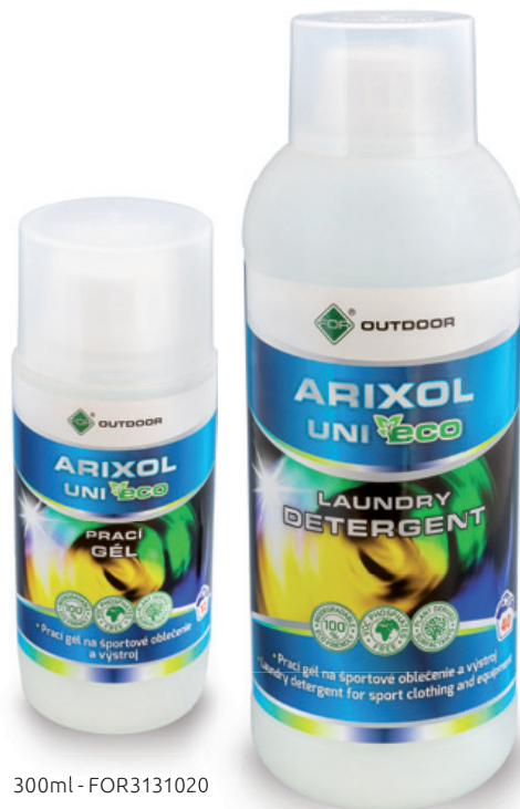
300ml - FOR3131020 1000ml - FOR3131100

is an effective, but gentle laundry detergent for sport clothing and equipment made of natural and synthetic materials including functional (membrane and insulation) materials, suitable for both machine and hand washing. ARIXOL UNI eco effectively removes dirt and leaves no residue, thus helping to restore the original properties of functional materials. It leaves the garments completely odourless after washing. ARIXOL UNI eco was developed with maximum respect for environment, it contains plant derived surfactants and does not contain any bleaches, optical brighteners, fabric softeners, fragrances, dyes, enzymes, phosphates, fluorocarbon compounds (PFCs), ethoxylated alkylphenols (APEOs) and volatile organic compounds (VOCs). It is 100% biodegradable and environmentally friendly.