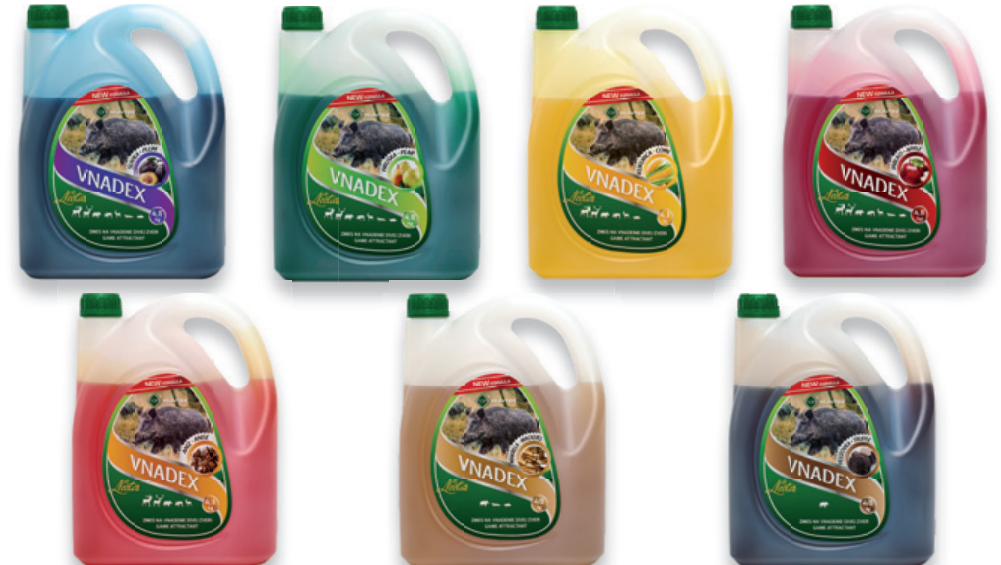
Anise: 4,8kg FOR2V61400 Smoked mackerel: 4,8kg FOR2V51400 Truffle: 4,8kg FOR2V71400