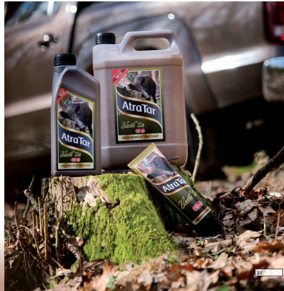
FOR213B570 – 5,7kg canister FOR213F120 – 1,2kg bottle FOR213T032 – 320g Tube