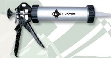
Application gun 400 ml - FOR27XP040

AtraSalt paste 2.4 kg is salt paste in sausage for fast and easy application by sausage caulk gun.