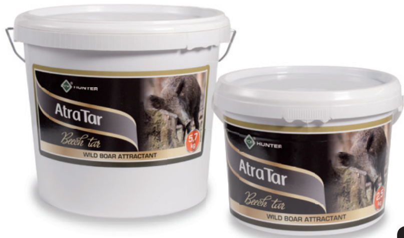
FOR213V570 – 5,7kg bucket FOR213V250 – 2,5kg bucket